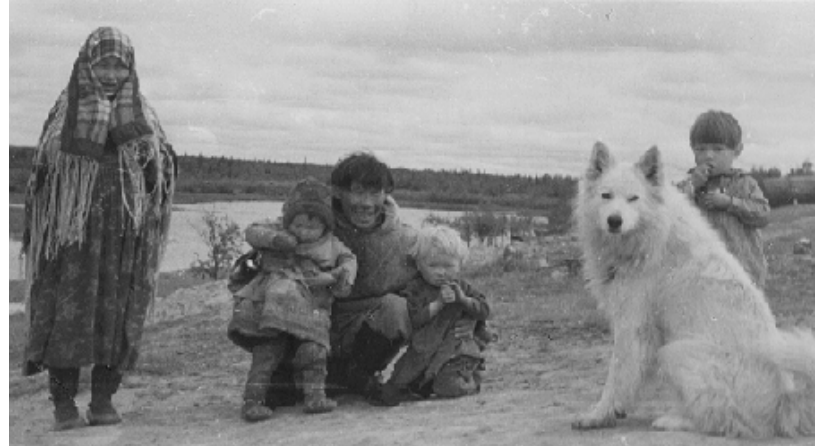
The Sosva River mouth, a tributary of the Ob River. 1962.

Sweden for his service to our expedition. Khabarovo, August 3, 1893. F. Nansen." Thus, "on the 29th, we arrived to