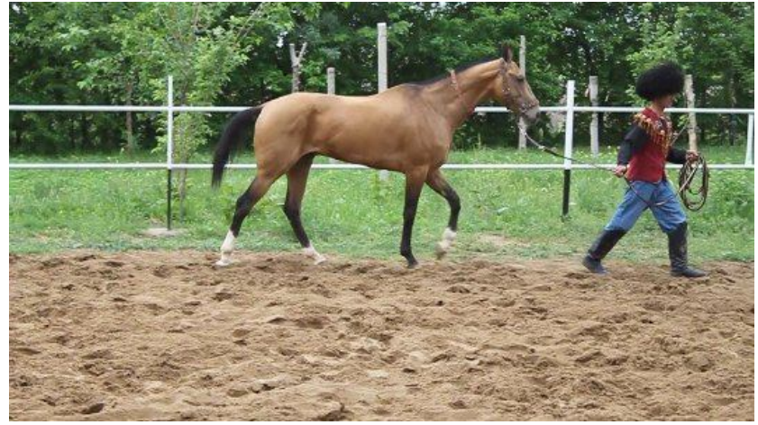
Akhal teke and groom