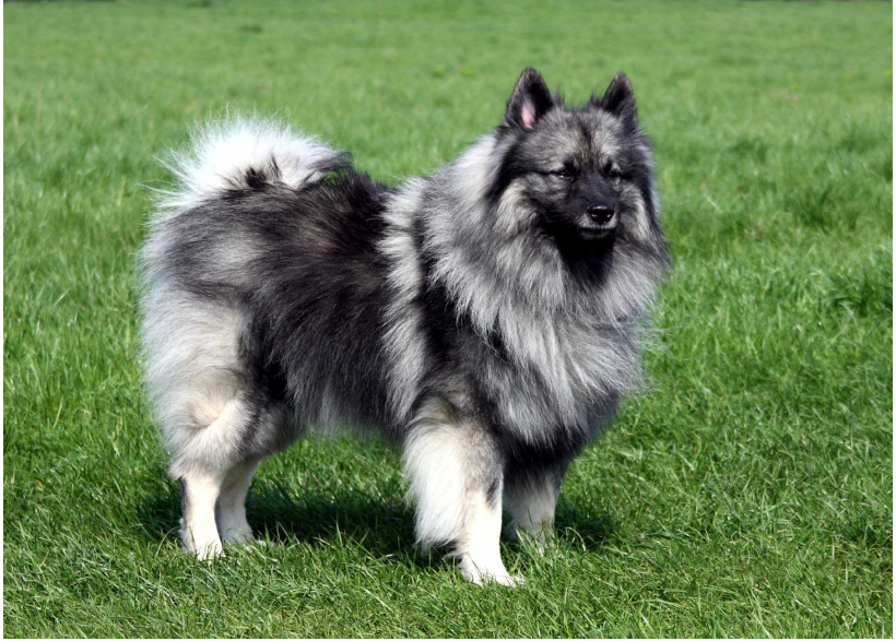
Wolfsspitz of the old German type.

always a very vivid and constantantly changing part of all pure bred dogs. Something that is right today may be outdated in a couple of years because of the development of breeding. The standard is not the Bible, it has to be improved and expanded again and again.