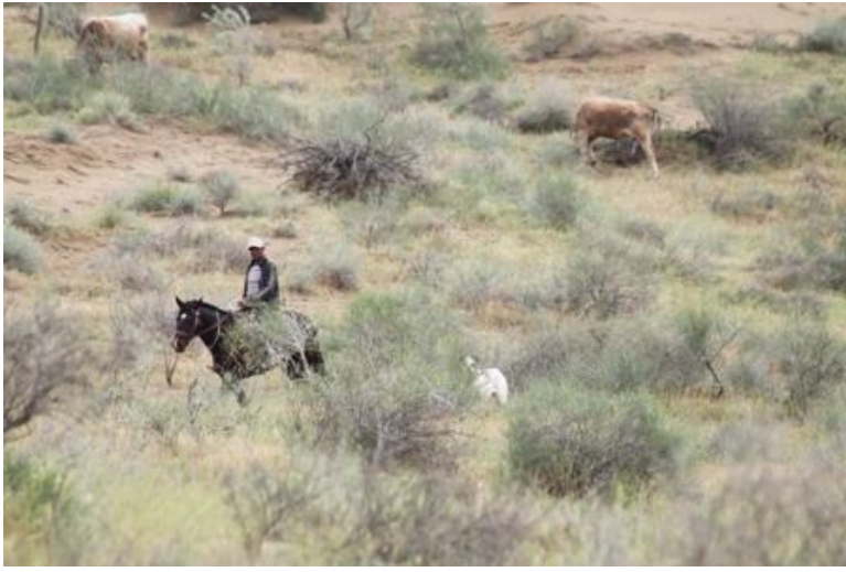
Cowboy with Alabai