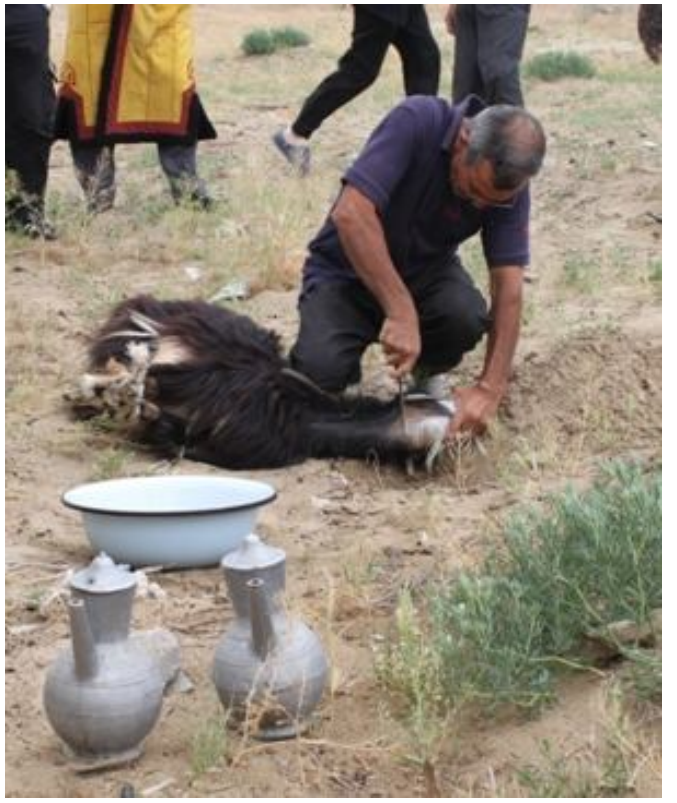
Slaughtering the goat

cream female. But first we had to follow custom and after introductions to the shepherds we drank from a foaming bowl of fresh camel's milk and we were honoured with the slaughter of a goat for lunch.