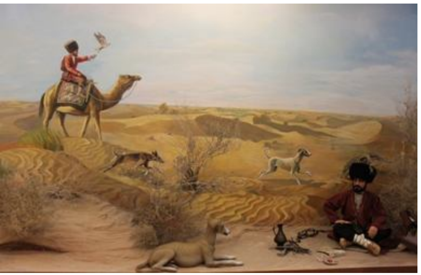
Desert hunting scene from the History Museum