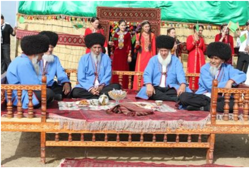
Turkmen elders celebrating

With the renewed interest in these different aspects of Turkmenistan's natural heritage, which has