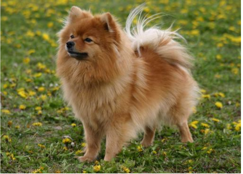
Orange has always been an existing coat colour in the breed – today it is only recognized in the Standard, Small and Toy variety of the breed (the picture shows a Standard Spitz).

Please read more about colour genetics in the third and last part as well as about the abundance of colour in the Spitz and a look into the future.