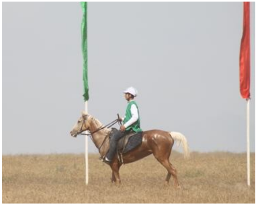
Akhal Teke racing

breed which coincided with my visit and among other manifestations there was an all-day endurance race over a huge circular course with stations along the way where people in their colourful national costumes danced and sang and generally had a good time.