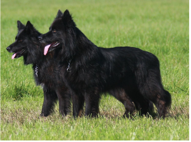
Black Middle German Herding Dogs.