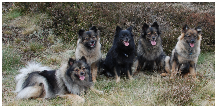
A group of Standard Spitz dogs (Mittelspitz) – at the center a black dog with tan markings on the legs, on its right and left Spitz dogs of a gray shaded colour of different intensities.