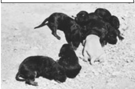
Puppies of red bitch

think of Dobermans – enormously powerful hounds that one or two of my friends disparaged as too heavy for serious coursing. That would have been my reaction too if I had not known the equally powerful grandsire of three of them with which I had coursed some years ago and which had accounted for three foxes and four hares in a morning.