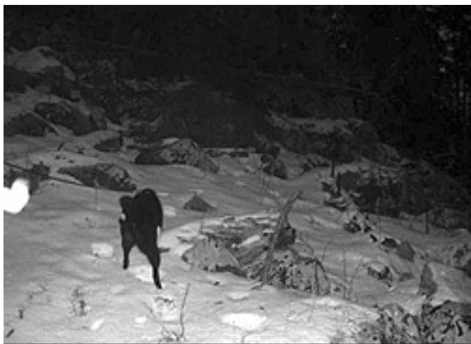
Taras following a bear's track in Slovenia

Character is a sufficiently indefinite term that summarizes some fundamental components: first docility, which is also the malleability of a dog; after that attention, how much and how long a dog can concentrate; and temper, dog's resistance to outdo a determined stress, and then how much the subject is willing to cooperate with the master, a factor quite difficult to quantify. The character also has a genetic base, which is due to breeding, so that a particular breed is inclined to a determined task (e.g., Retriever-retrieving, Border-Collie, flock shepherding, etc.).