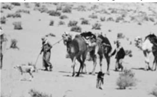
Camel train in Wadi Rum

The first major difference from Syria manifested itself when I started to ask questions in Arabic about the Saluqi. At first the Bedouin appeared mystified, until one of them