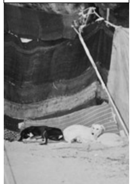
Hazza and La'ban outside our tent

Our companions were my friend's mother, who looked after the livestock, his brother and a couple of their friends. We also had with us La'ban, a six-year-old smooth black and tan dog, Hazza, a smooth cream bitch and Warda, a two-month-old smooth white bitch, which proved the star attraction. La'ban was from the north near the Iraq border and Hazza from towards Sinai: they both had the broad heads and turned back ears of some of the Saluqis in North Africa. Hazza was one month pregnant. Warda was the product of a red and white bitch and a grizzle dog from another village in Wadi Rum. She had almost died as a small puppy when she had banged her head, which swelled up like an egg. My friend took it away from the breeder, syringed away the fluid from the swelling, gave her some antibiotics and she made a quick recovery. She had a lovely nature, was sharp and strong and I would gladly have had her.