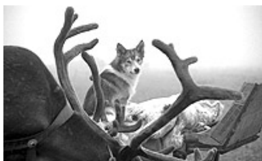
Reindeer herding dog.