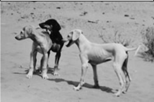
Warda and her siblings

Wadi Rum is now a protected area and hunting is not allowed. So my friends could only simulate how they used to hunt and train their Saluqis for hunting in the old days. The first day we went to see a camel train wending its way down the Wadi with Saluqis trotting alongside, just as they would have done in past times. The Saluqis learnt to trot in the shadow of the camels, though if it became too hot for them they might be lucky enough to be carried in panniers on camelback. In this fashion they travelled the length and breadth of the Arab world, where sometimes they might be given away to dignitaries en route or be used for breeding, so that then as now the breed would be constantly spread and renewed far and wide.