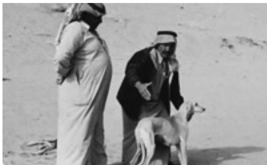
Bedouin explaining the standart.

Back in the village a sad sight greeted us. The feathered sister of Warda's dam appeared with four small, furry puppies pursuing her for a feed. She belonged to my friend. When in season one of the big guard dogs that hung around the village had somehow got into the compound where she lived and mated her. The puppies were therefore only "Luqis" and would not be kept but distributed among the shepherds as guard dogs. She was however a good bitch and would be kept. One of the Bedouin told me in all seriousness that the number of puppies in a litter depended upon the number of ties: there would be one puppy for each tie!