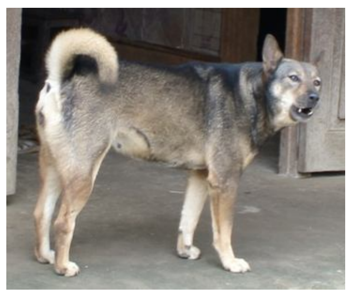
To preserve through education.....