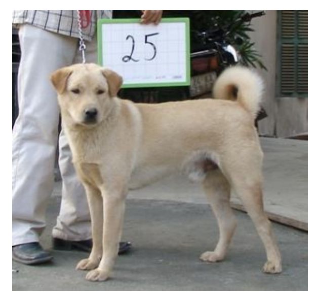
To preserve through education......