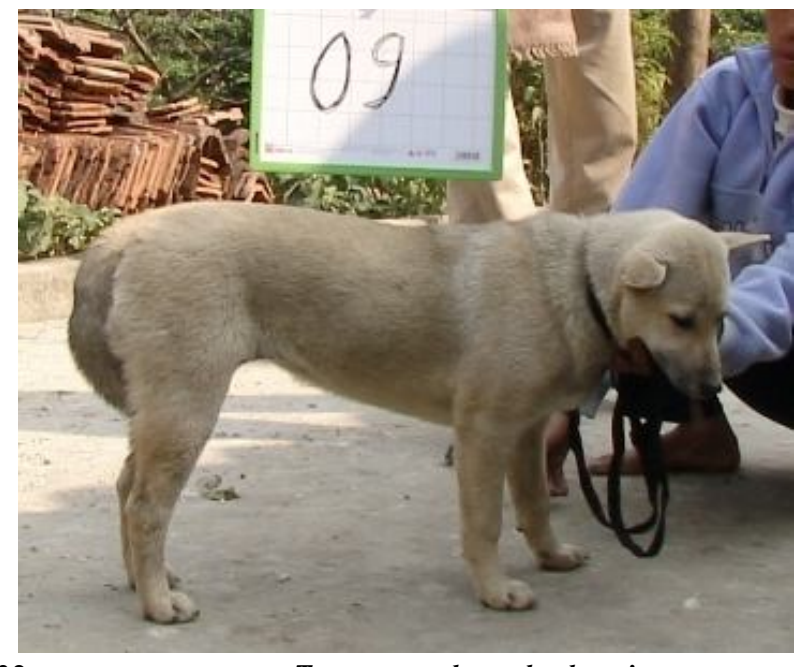
To preserve through education.....